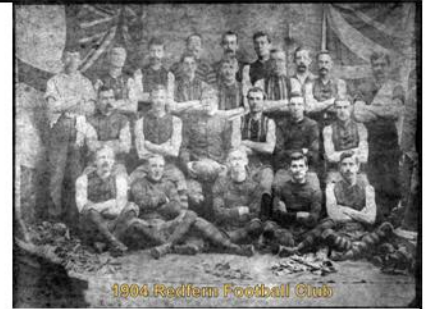
1904 Redfern Football Club

On the right is a 1904 image of the Redfern team. Unfortunately it does not contain any names but is an example of the state photos can get to if left to the elements. The bill for stopping the decay of four of our photos is over $1300.